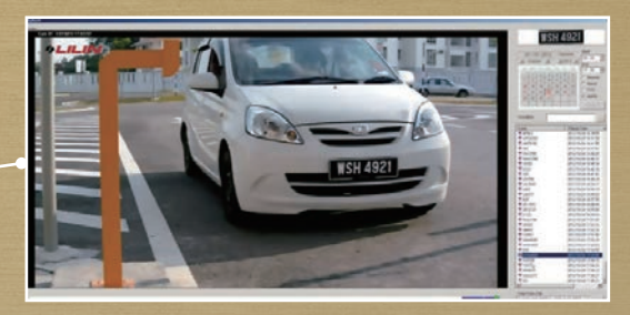
ANPR License Plate Recognition