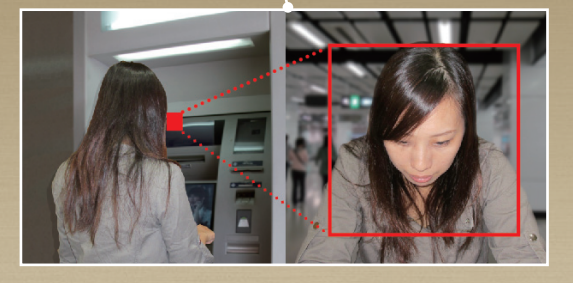
Detection Features Face, motion, tampering, and color detection