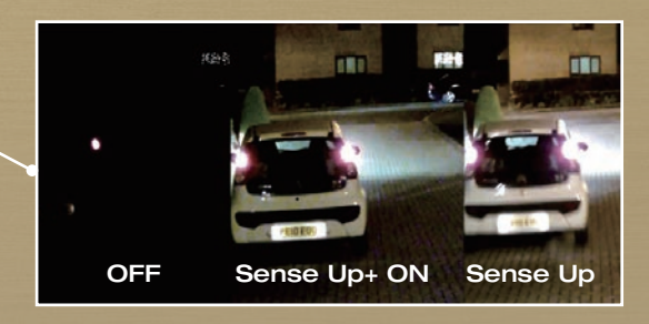
Sense Up+ Deliver outstanding video outputs in low light ondition