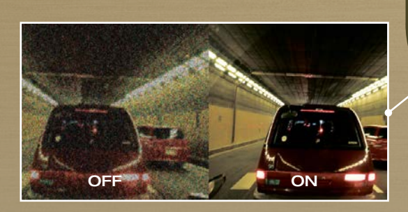
3D Noise Reduction Remove noise from a signal