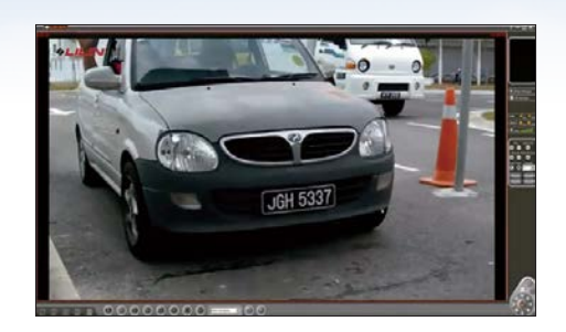
ANPR (License Plate Recognition)