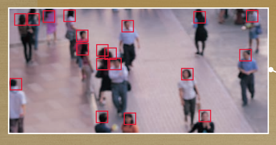
People Counting Measure hourly traffic level and evaluate Performance